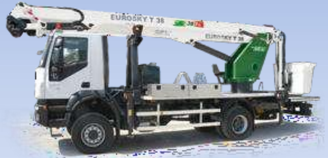
Insulated & Non Insulated Aerial Platforms