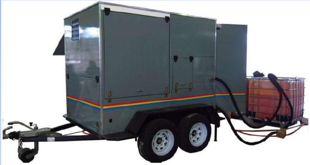
MOBILE TRANSFORMER OIL PURIFICATION PLANT

We offer diversified product portfolio of Transoil Services: