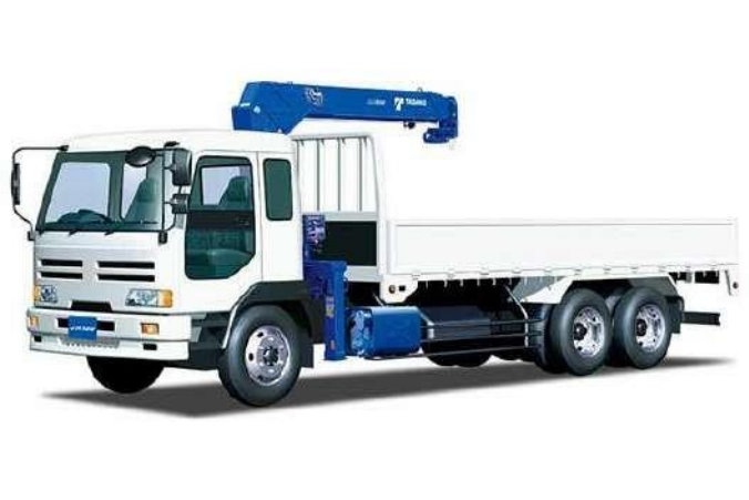
Truck mounted Cranes