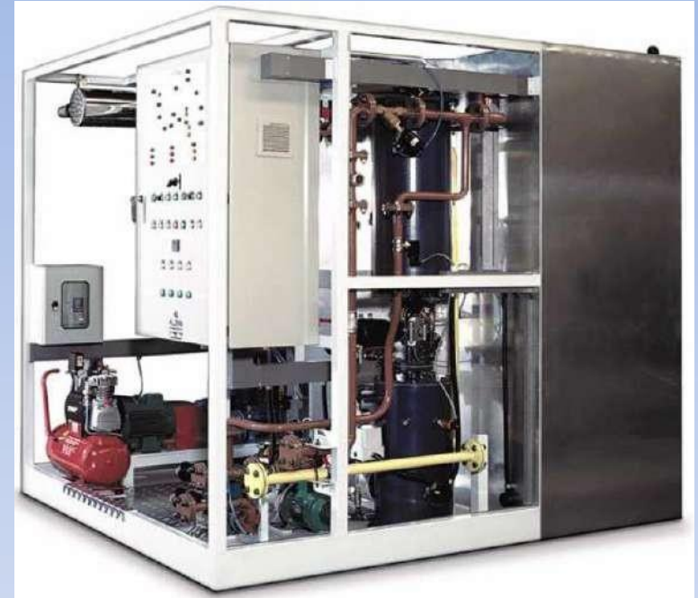
TRANSFORMER OIL REGENERATION PLANT