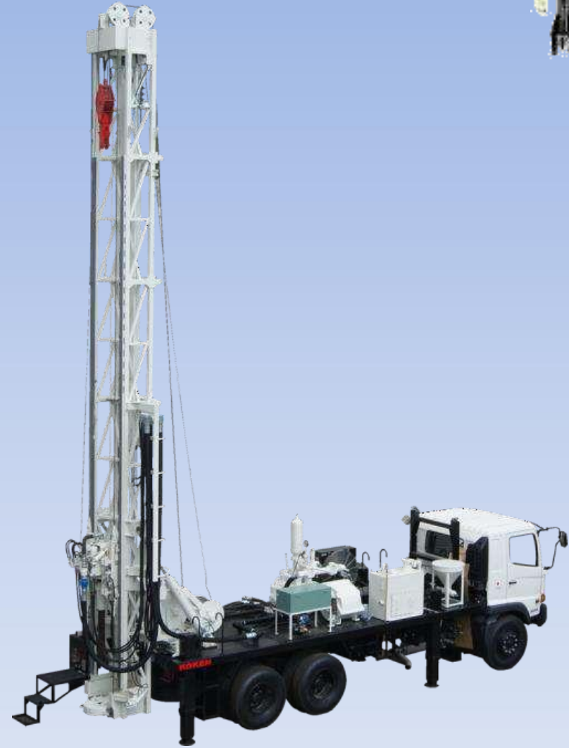
Truck mounted Water Well Drilling Rigs