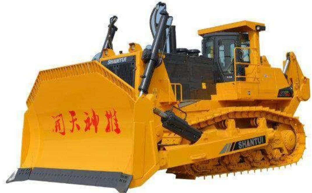
The Mighty Dozer "KONG"