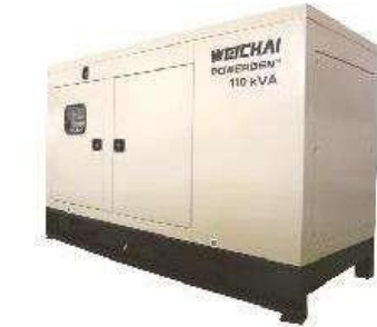
低噪音电站(10-500kW) Low-Noise Power Station(10-500kW)