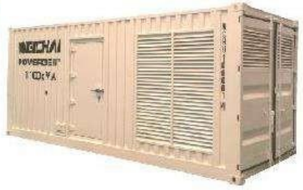
方舱电站(500-1000kW) Container Power Station(500-1000kW)