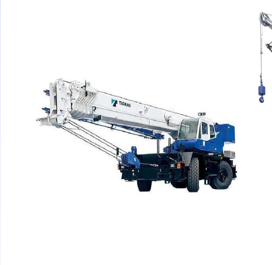
Rough Terrain Cranes