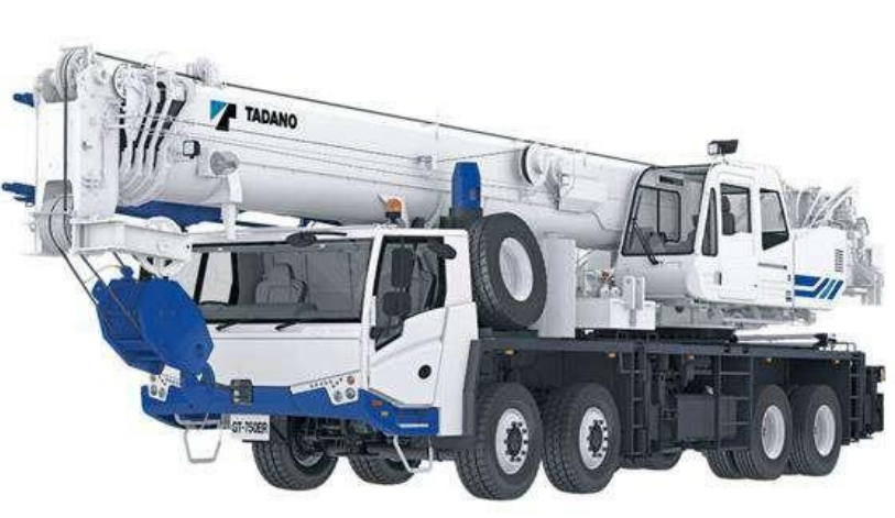
All Terrain Cranes